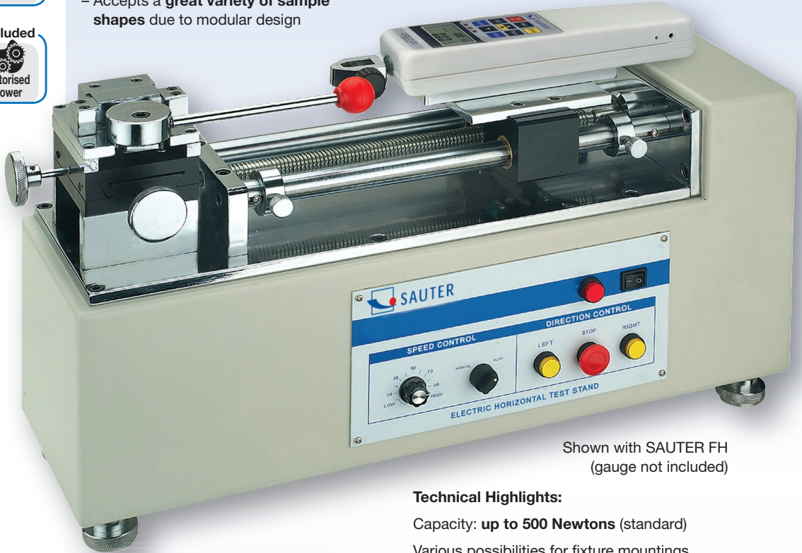
Shown with SAUTER FH (gauge not included)